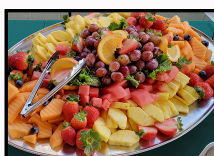
Fresh Fruit Tray