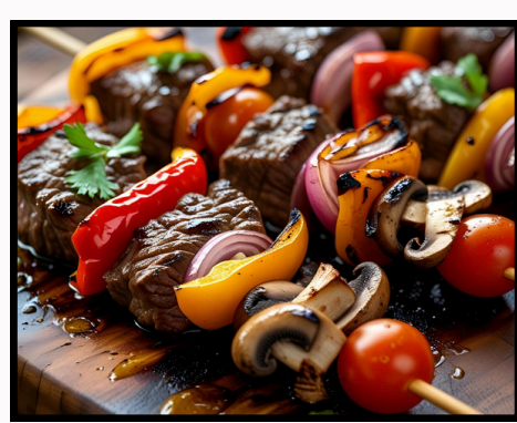
Grilled Beef Kabobs