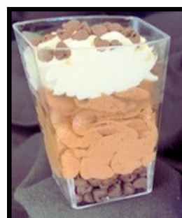
Chocolate Mousse Cup Cheesecake Delight Cup