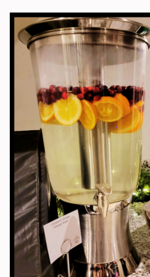
Cranberry Orange Infused Water