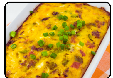
Mom's Country Breakfast Casserole

House made baked French toast with a hint of orange, dried cranberries, and our sweet orange vanilla sauce ($55)