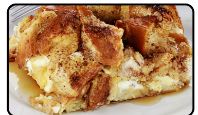
Aspen's Signature Baked French Toast