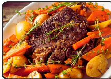
New England Pot Roast