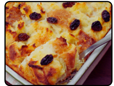
Cranberry Orange Bread Pudding