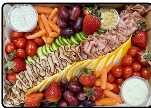
Aspen Traditional Grazing Box