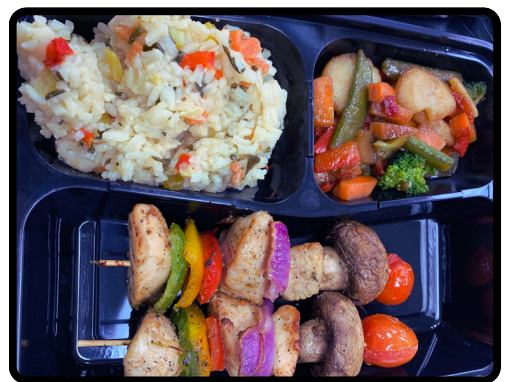
Grilled Chicken Kabobs Meal