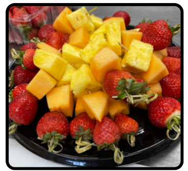
Fresh Fruit Kabobs