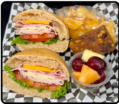
Signature Colorado Club Box Lunch