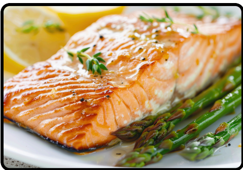
Lemon Basil Salmon