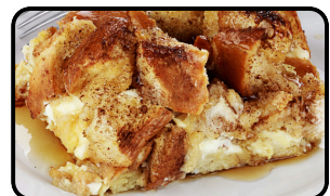
Aspen's Signature Baked French Toast