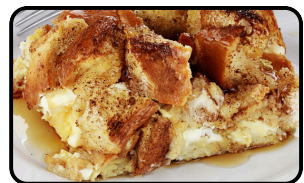
Aspen's Signature Baked French Toast