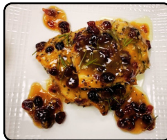
Cranberry Rosemary Chicken