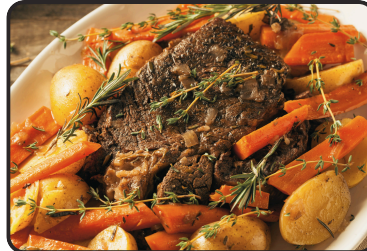
New England Pot Roast